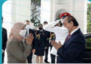
President of Vietnam Nguyen Xuan Phuc