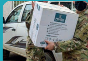
United States Navy