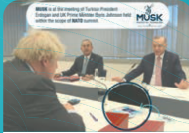
2021 Nato Leaders Summit Boris Johnson