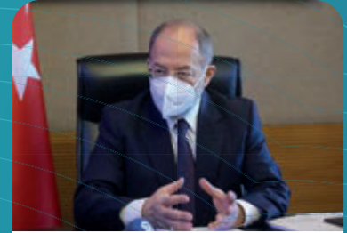
Recep Akdağ - 2012/2013 Health Minister of the Republic of Turkey