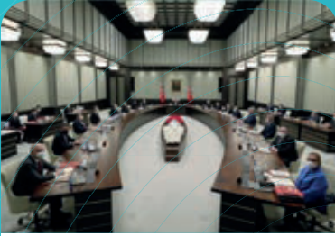
Pandemic Science Boarding Meeting