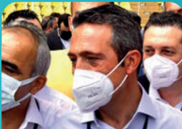
Ali Koç President of Fenerbahçe Sports Club